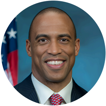
Scott Turner, United States' HUD Secretary

It goes without saying that January and February has been off to a very interesting start for the Affordable Housing Industry. I want to dedicate this issue to provide a brief introduction to our new HUD Secretary, Scott Turner. We look forward to the opportunity to hear more from Secretary Scott as the weeks and months unfold.