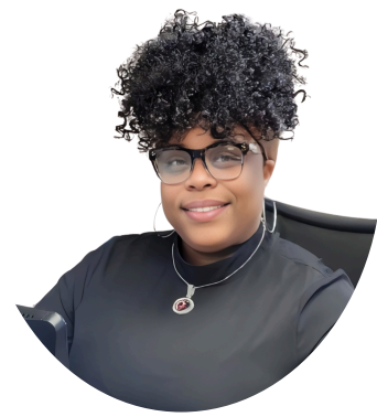
HCV Manager Vice President of Member Services

During a time when our agencies are facing a decline in economic support, the question may be - “Why Membership?” Your membership in the state chapter of NAHRO provides services that benefit you and your organization every day. ILNAHRO has committed itself to providing services such as: